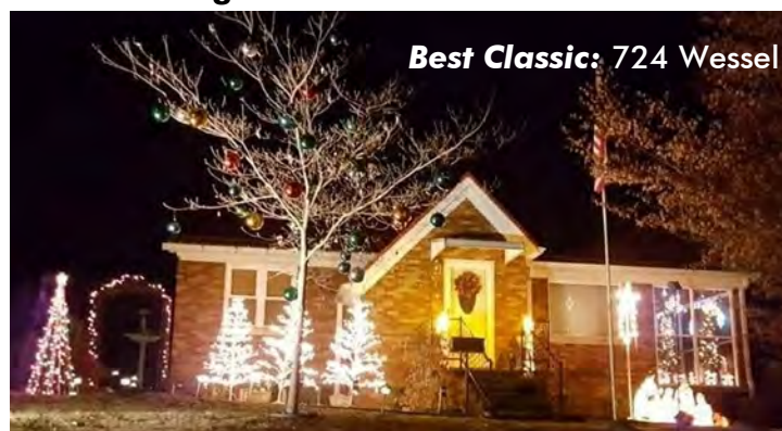
Best Classic: 724 Wessel