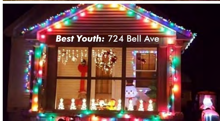
Best Youth: 724 Bell Ave