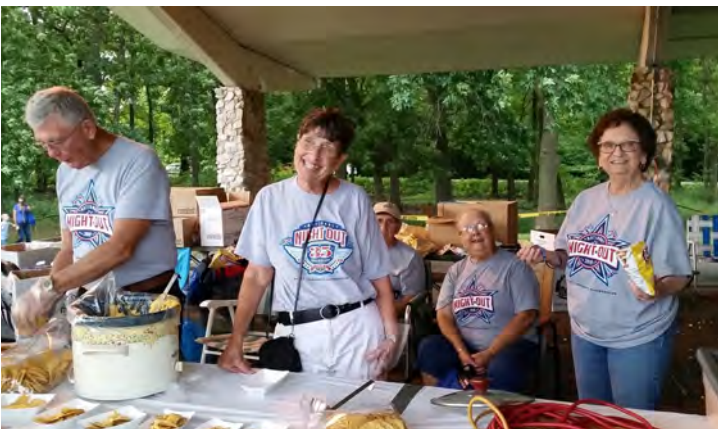
Volunteers from North Country Club NA at the 2019 National Night Out