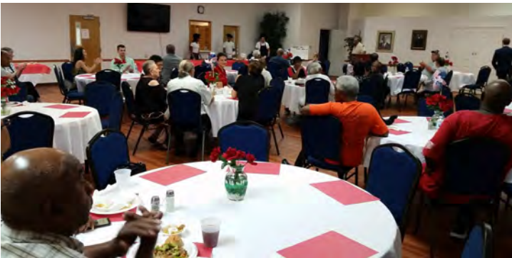
Glenwood NA recently held their annual appreciation banquet.