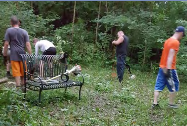
Members of Western Terrace NA cleaning up the Clem Frank Nature Preserve