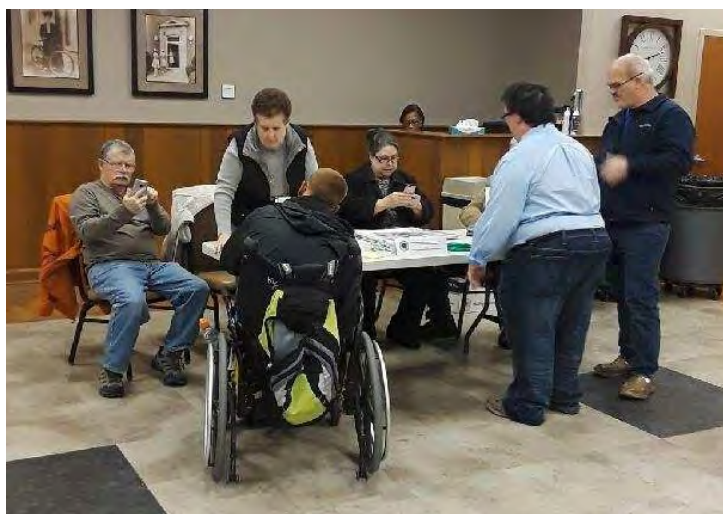
PHOTO (Left): UNOE Volunteers at the UNOE table during the January, 2019 Traveling City Hall, assisting guests with information in print, conversation, online and via the UNOE Neighborhoods app.

Check the "Upcoming Events" section of the City of Evansville website for more information www.evansville.in.gov