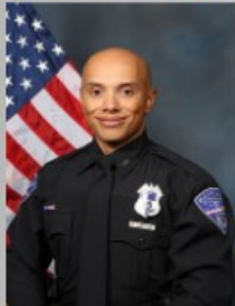
DC CHRISTIAN SOUTH SECTOR 1